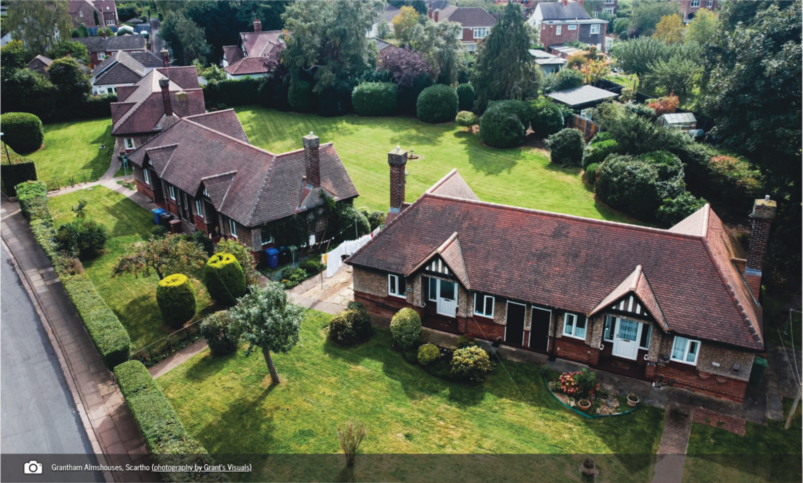
Grantham Almshouses, Scartho